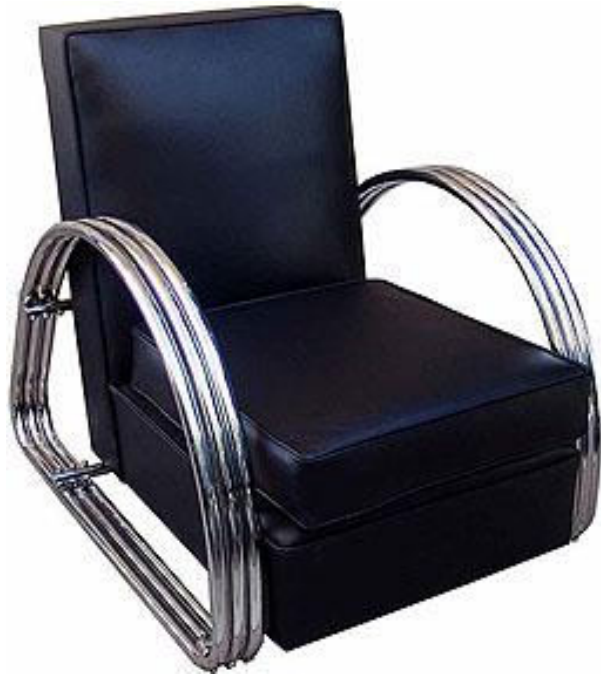
Art Deco Chair

Although many design movements have political or philosophical roots or intentions, Art Deco was purely decorative . At the time, this style was seen as elegant, functional, and ultra modern as well. The USA typified Art Deco as glamorous , embraced by 1920's Hollywood.