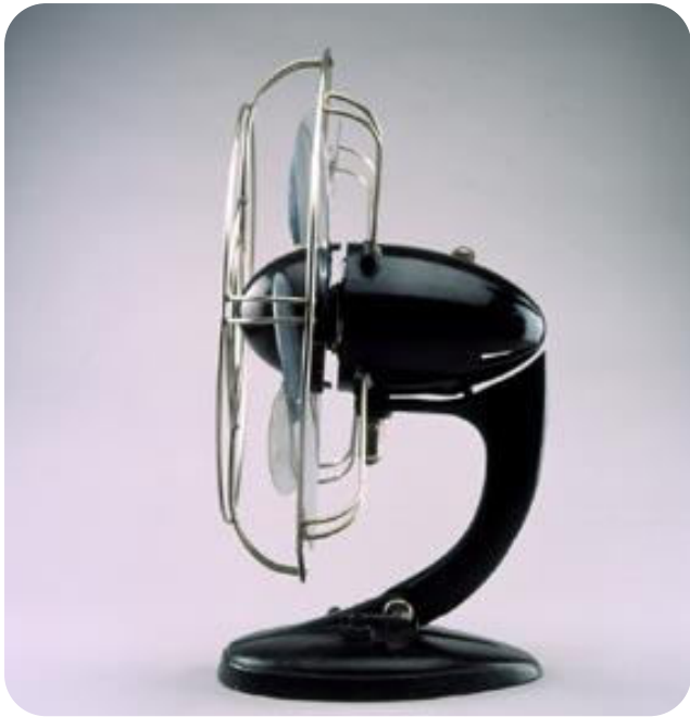
Table Fan: Robert Heller

The style was applied to appliances such as electric clocks, sewing machines, small radio receivers and vacuum cleaner. These also employed developments in materials science including aluminium and bakelite.