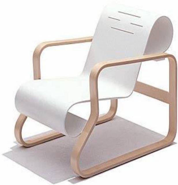
Armchair 41: Alvar Aalto

Scandinavian Modern is an extremely popular design movement which remains prominent to the Design world today. This of course was helped by the popularity of IKEA , a Scandinavian furniture store, on a global scale.