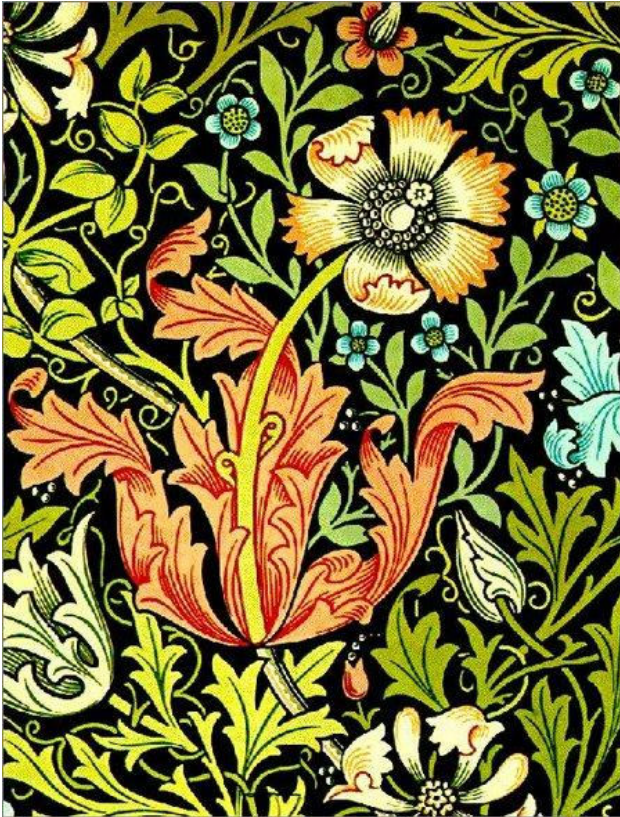
Wallpaper: William Morris

The Arts and Crafts movement was a British and American aesthetic movement occurring in the last years of the 19th century and the early years of the 20th century. Inspired by the writings of John Ruskin , it was at its height between approximately 1880 and 1910.