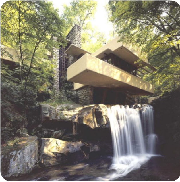
Falling Water: Frank Lloyd Wright

A well-known example of organic architecture is Fallingwater , the residence Frank Lloyd Wright designed in rural Pennsylvania. Think also of the Sydney Opera House, and of the designers Alvar Aalto and Charles Rennie Mackintosh.