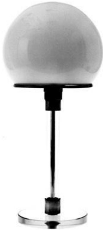
MT8 Table Lamp: Wilhelm Wagenfeld

The ethos of Bauhaus changed so many times over the course of the school's existence that it is impossible to exemplify its work. It's most notable examples of work are the buildings at Weimar and Dessau .