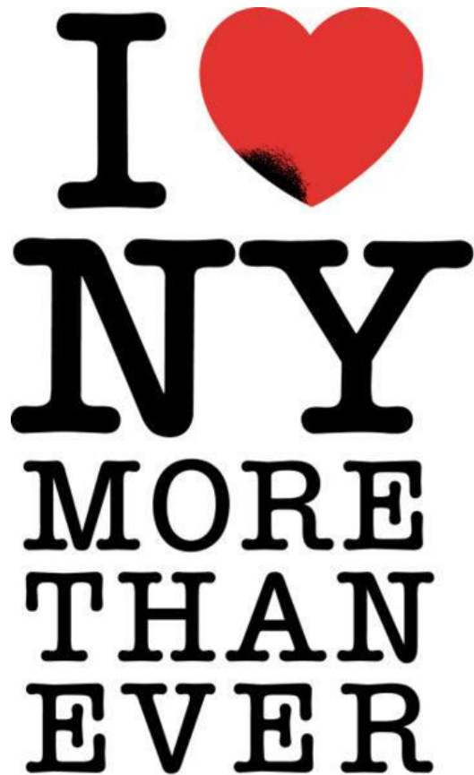
“I Love New York” II: Milton Glaser

The style came into its own during the 1980’s and Postmodernism often incorporated extremely symbolic clues in its work. The “I Love New York” logo is an example of this, with its modification after 9/11.