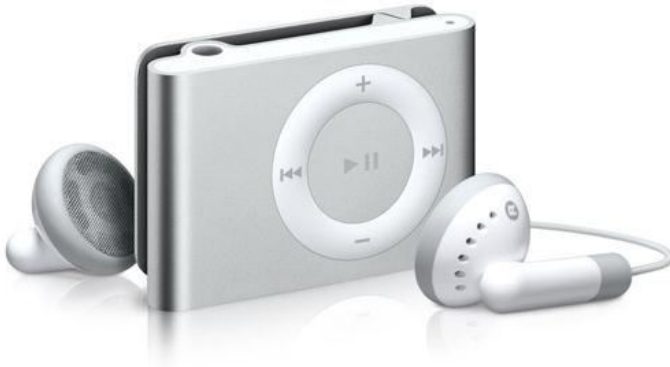
iPod Shuffle: Apple (Inspired by Minimalism)

The movement was developed in New York and encouraged geometric forms , extreme simplicity and the use of light. Some find the style calming ; others view the style as cold and unwelcoming .