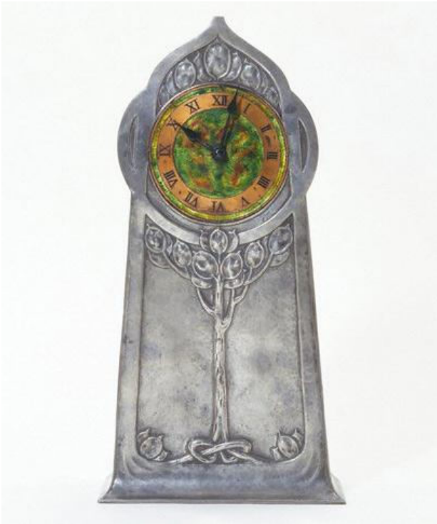
Art Nouveau Pewter Clock: Archibald Knox

Art Nouveau (French for 'new art') is an international style of art, architecture and design that was most popular at the beginning of the 20th century (1880-1914) and is characterized by highly-stylised, flowing, curvilinear designs often incorporating floral motifs. Natural Design.