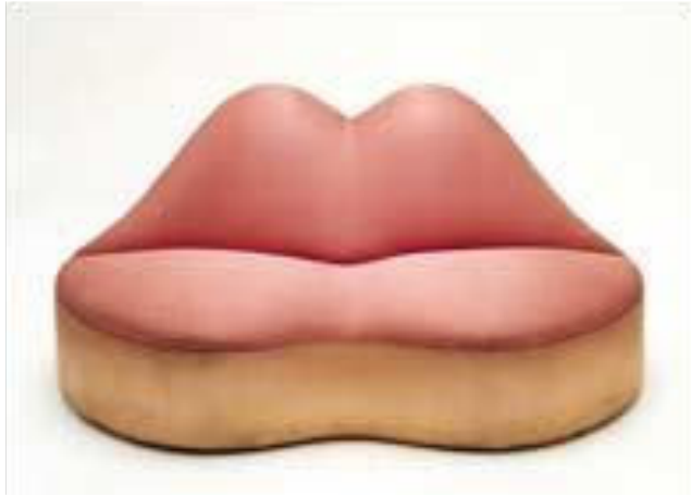
Mae West Lips: Dali

Surrealism is a cultural movement that began in the mid-1920s, and is best known for the visual artworks and writings of the group members.